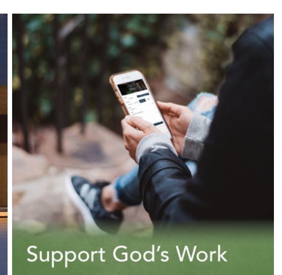
We are grateful for your generous support. To give now, click here .