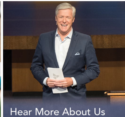
Learn more about life at Christ Church at Meet the Pastor on June 27.