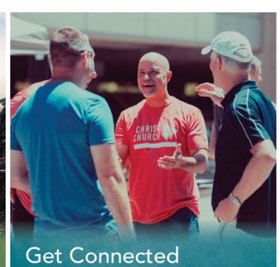
Come grab a meal and enjoy some conversation at Man Cave summer gatherings. Learn more here.